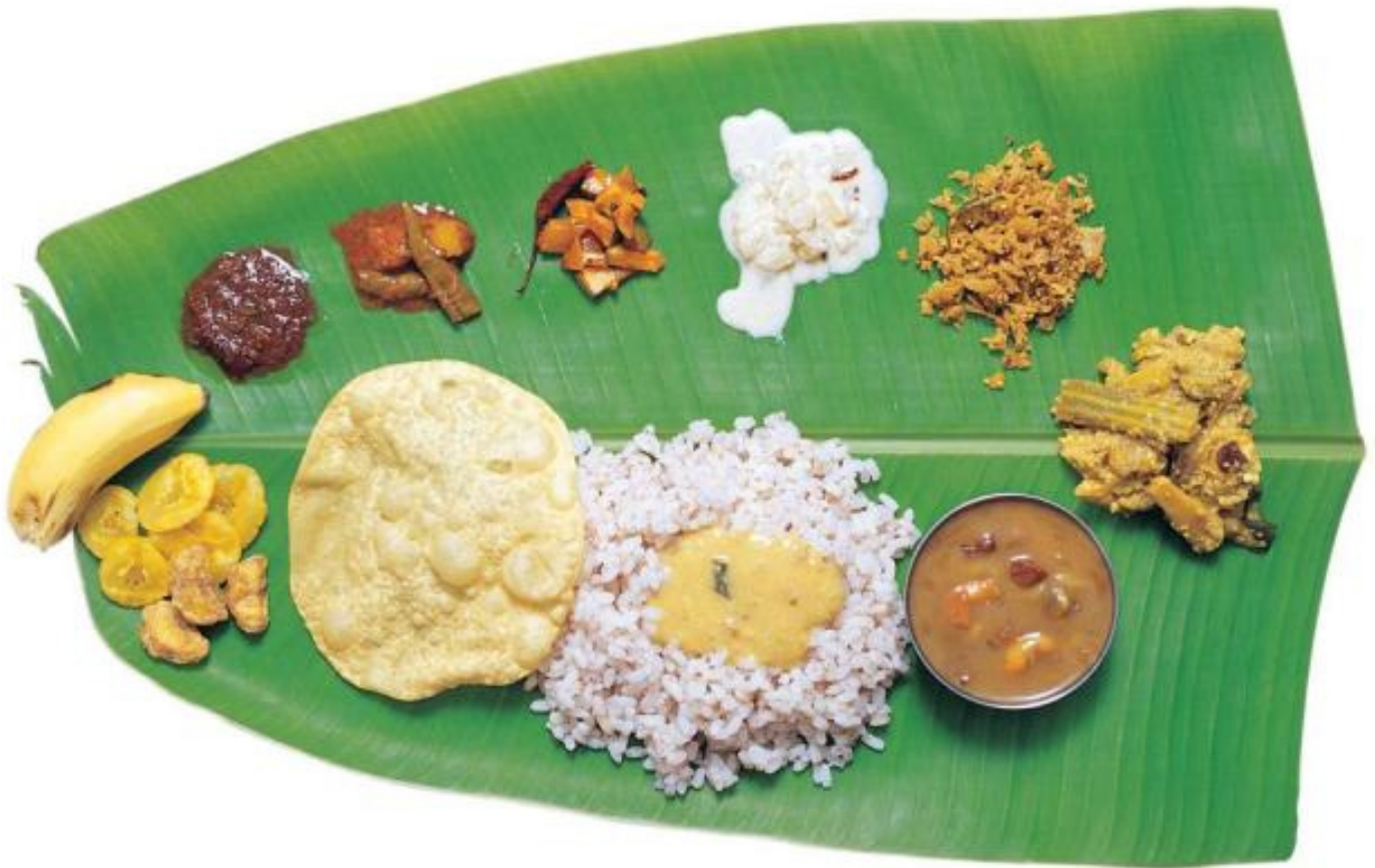
Sadhya – Onam Feast